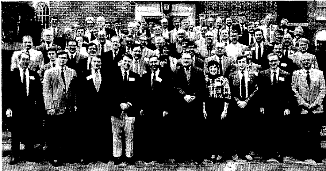
Group picture at Saturday morning break